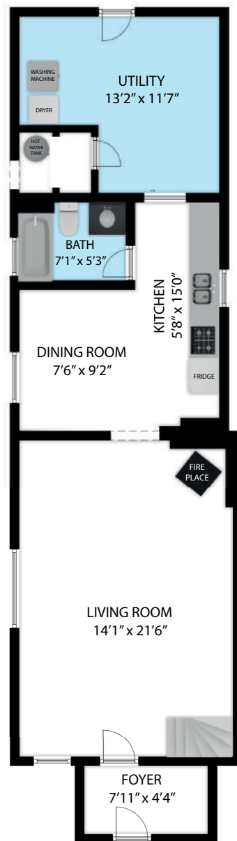
MAIN FLOOR (835 SQ.FT)