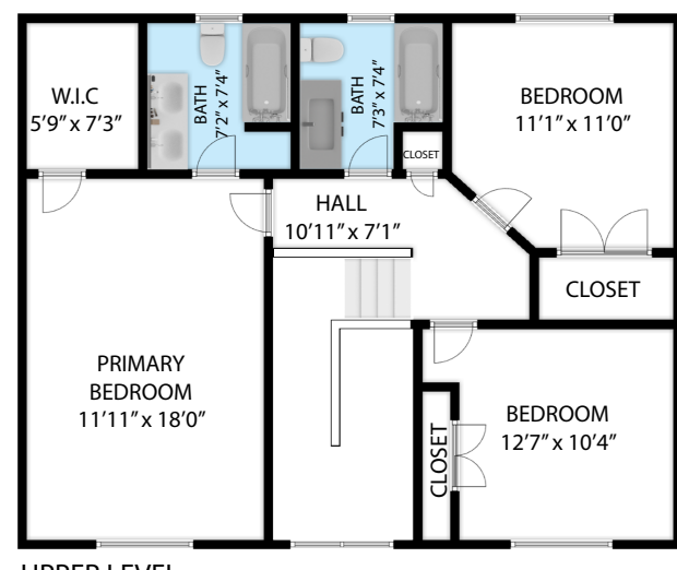
UPPER LEVEL 885 SQ.FT